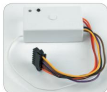
433MHz-RX Ultra-small 433MHz Receiver