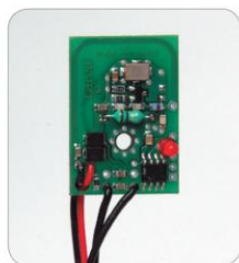
433MHz-TX Ultra-small 433MHz Replacement Transmitter